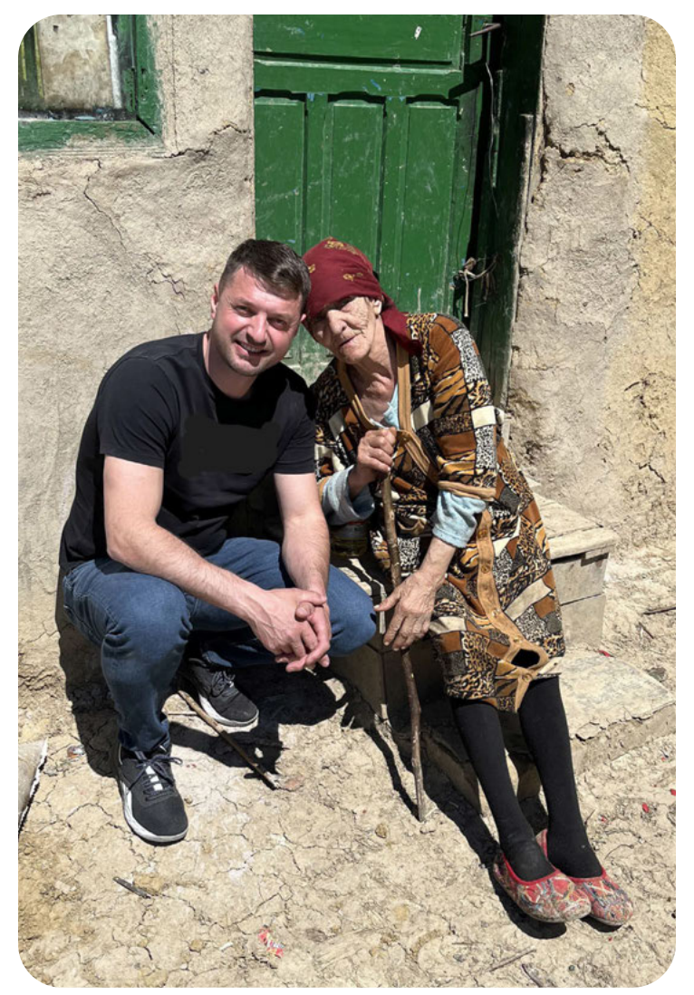
Please see more pictures from my latest trip to Romania on pages 6 & 7.