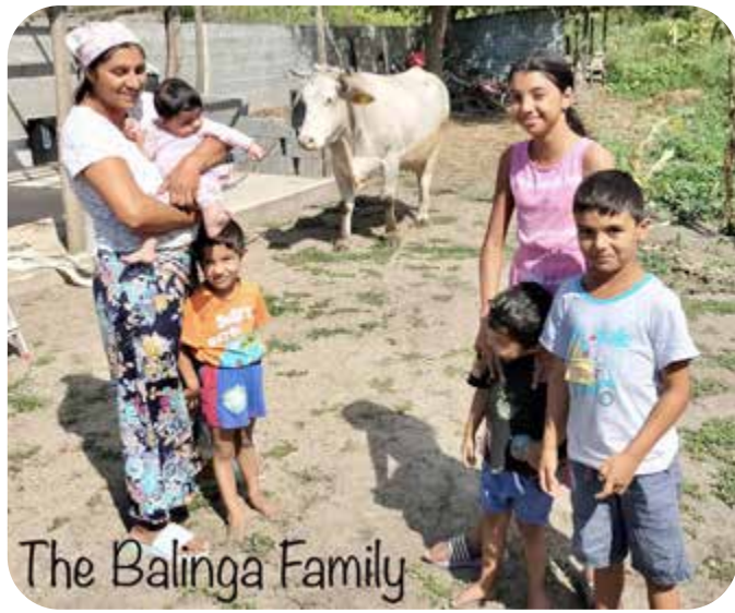
The Balinga Family