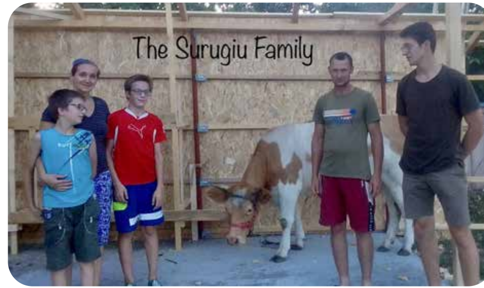
The Surugiu Family