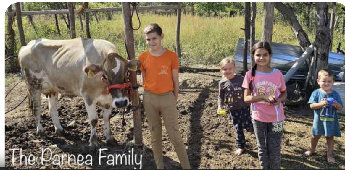
The Parnea Family