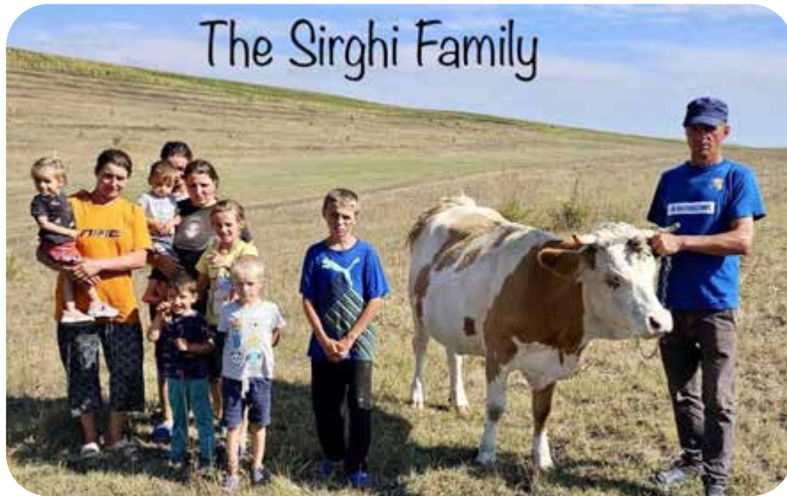
The Sirghi Family