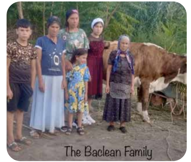
The Baclean Family