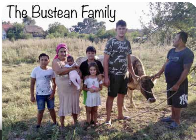
The Bustean Family