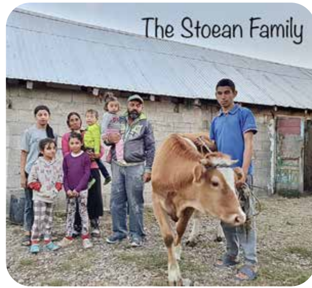
The Stoean Family