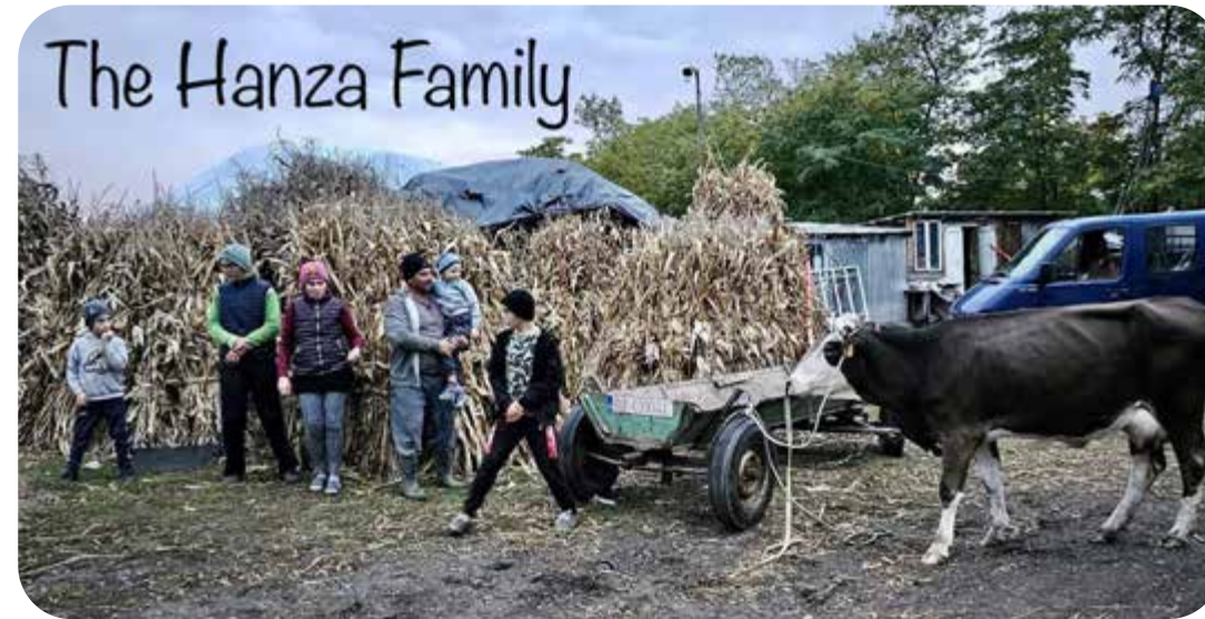
The Hanza Family